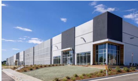
North Washington Commerce Center, Thornton, CO